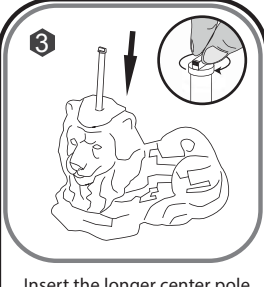
Insert the longer center pole piece #95 after assembling piece #94 and turn right to tighten the puzzle pieces.