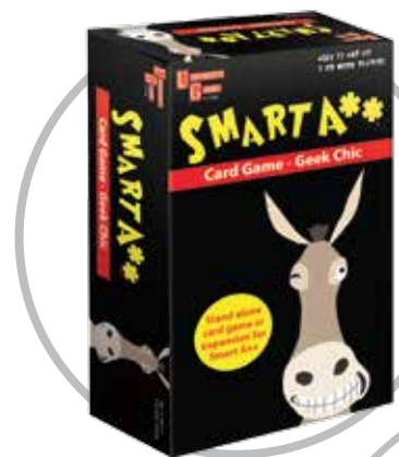
Smart A**® Geek Chic Card Game/Expansion Pack Ages 12+