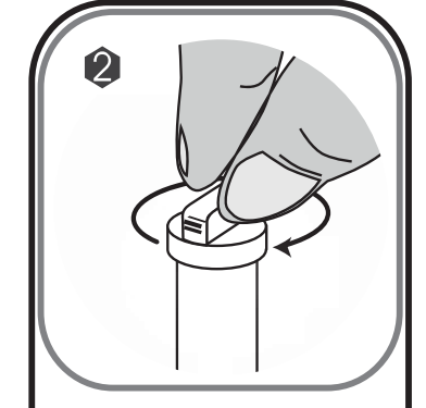
Insert the center pole piece and lock the puzzle pieces by turning tightly.