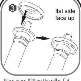
Place piece #29 on the pillar, flat side up.