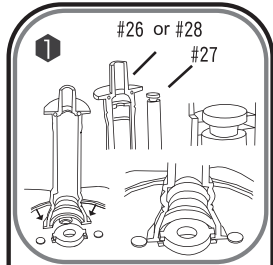
Slide one pillar piece #26, or #28, into the base. Hang central pole # 27 in proper position with the pillar and then cover with another pillar piece.