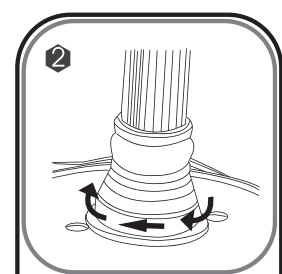
Once both pillar pieces are combined, hold them and rotate clockwise to lock pillar firmly to the base.