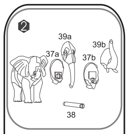
Two trunk options for the Big Elephant: Trunk up 37a and 39a Trunk down 37b and 39b