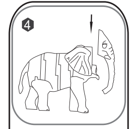
To complete the assembly, insert the Elephant head #39 to piece #37,