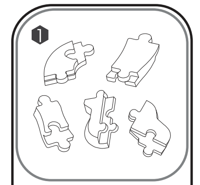
Don't lose any of the puzzle pieces.