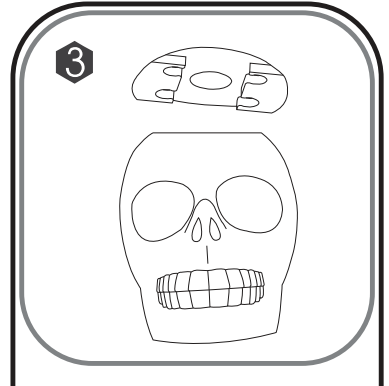
Put piece #48 on top to cover the center pole piece.