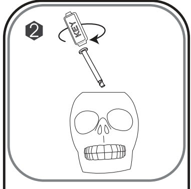
Insert the center pole piece and use the key to tighten the puzzle pieces.