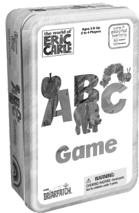
The World of Eric Carle™ ABC Game Ages 3 and Up